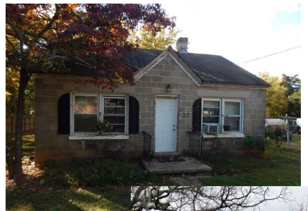
$21,950 in LHR funds