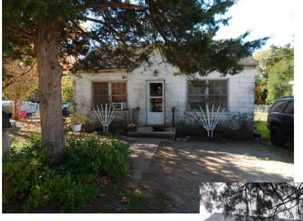
$13,300 in LHR funds