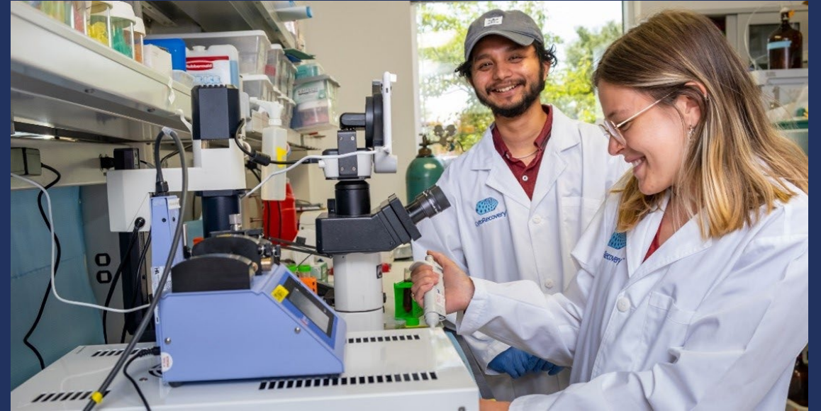
COgro Labs at Virginia Tech Corporate Research Center (Source: GO Virginia Region 2 Annual Report)