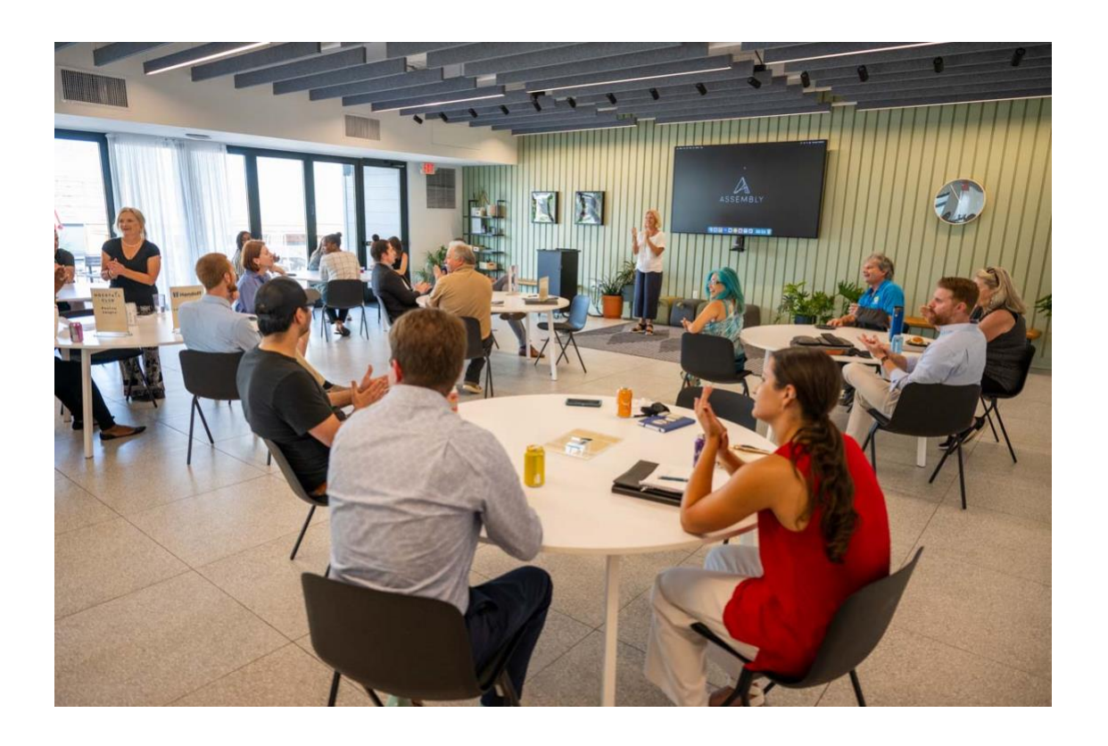
757 COLLAB Mentorship Roundtable