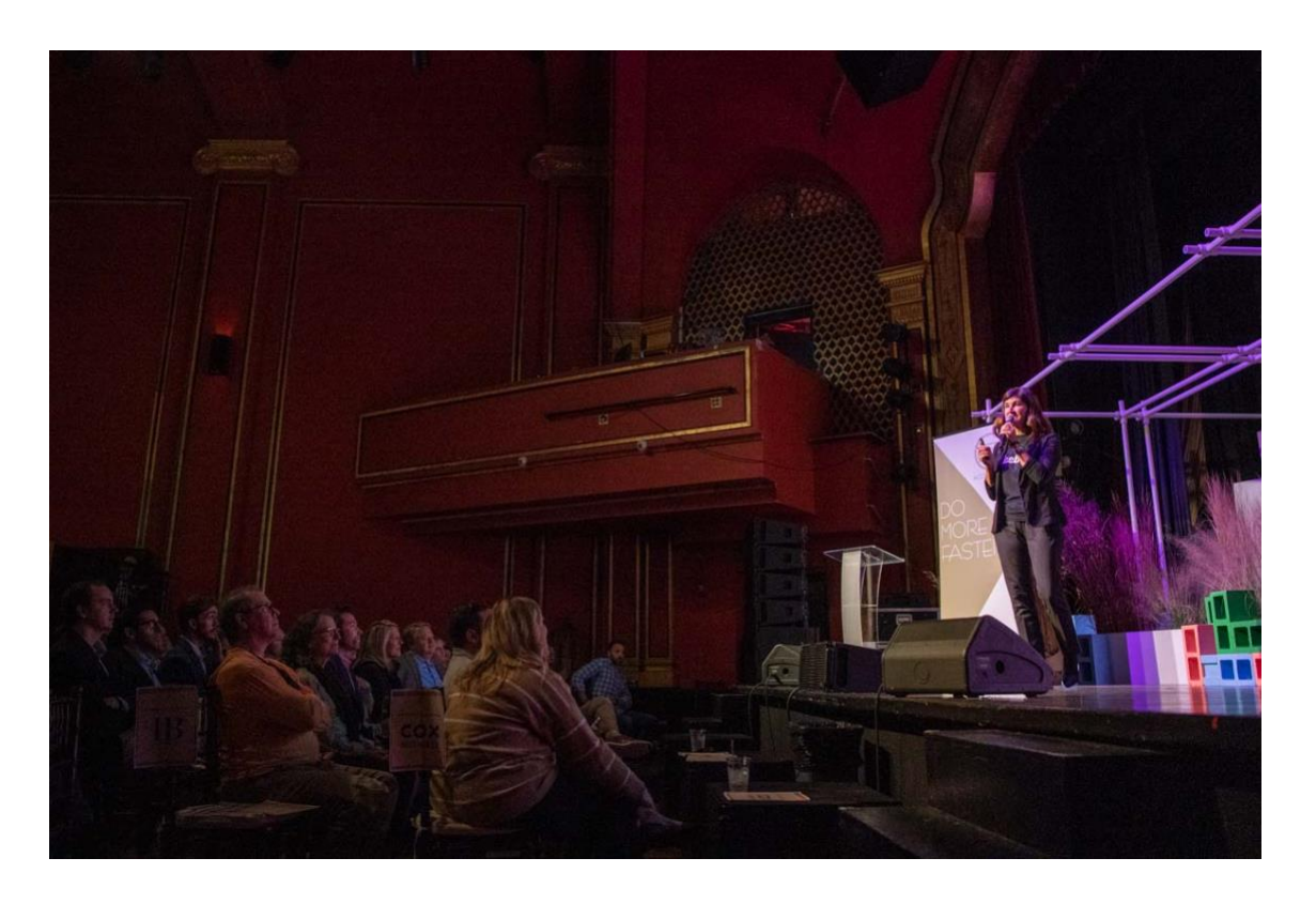
757 Accelerate Community Pitch Event