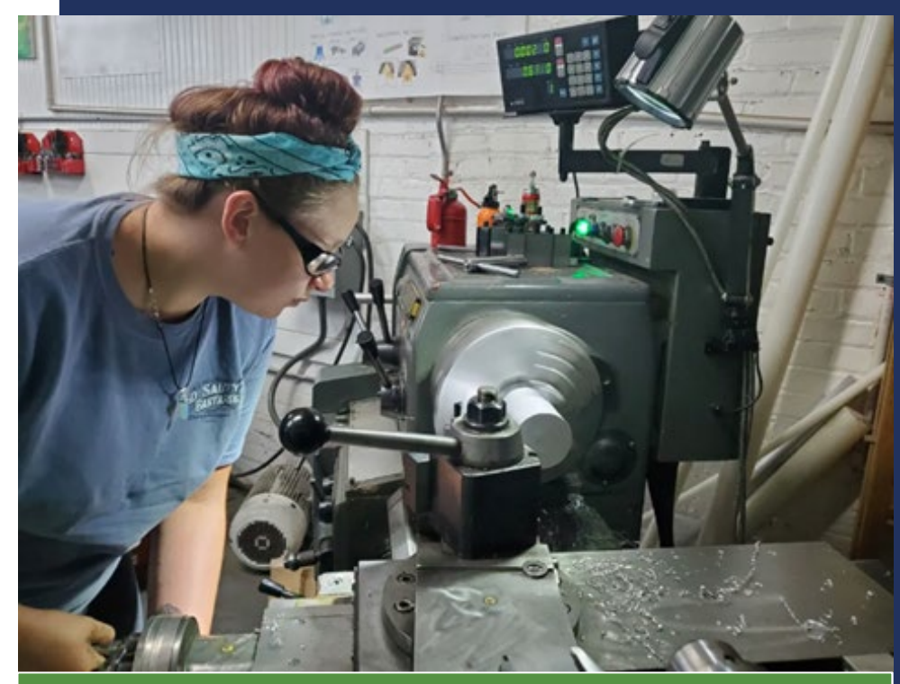
A student in the Women in Machining class at Vector Space in Lynchburg

Business Meeting March 14, 2023 Library of Virginia, Richmond, VA